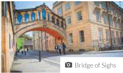
📷 Bridge of Sighs