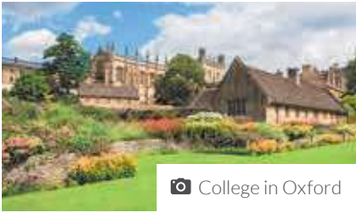
📷 College in Oxford